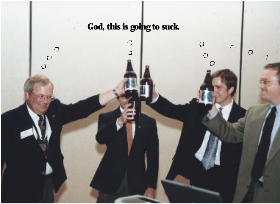
God, this is going to suck.