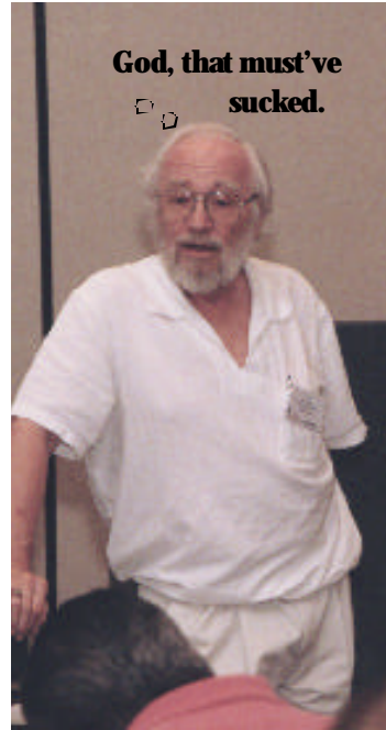
God, that must've sucked.