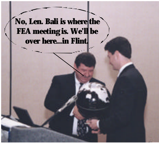
No, Len. Bali is where the FEA meeting is. We'll be over here...in Flint.