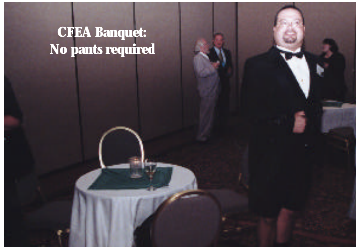
CFEA Banquet: No pants required