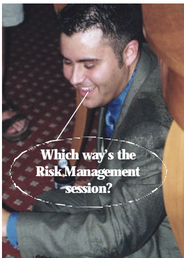
Which way's the Risk Management session?