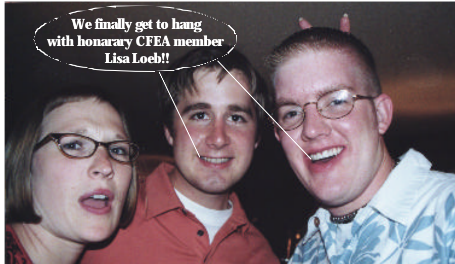
We finally get to hang with honorary CFEA member Lisa Loeb!!